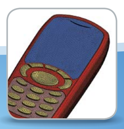
Batch Meshing for Automated Rapid Model Generation